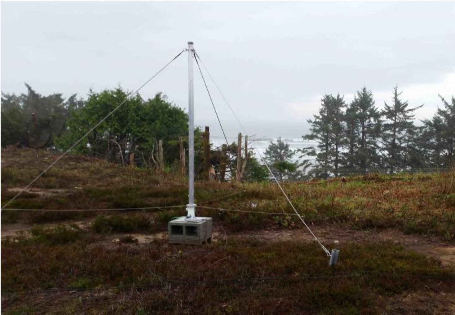
Fig.2 ? One of 16 antennas in the near-field tsunami alert installation (WERA NorthernRADar) overlooking the Pacific Ocean near Tofino, on Vancouver Island.

Additional shore-based high frequency radar (CODAR) installations, designed to support marine safety assessments, are moving forward at several sites in the Strait of Georgia.