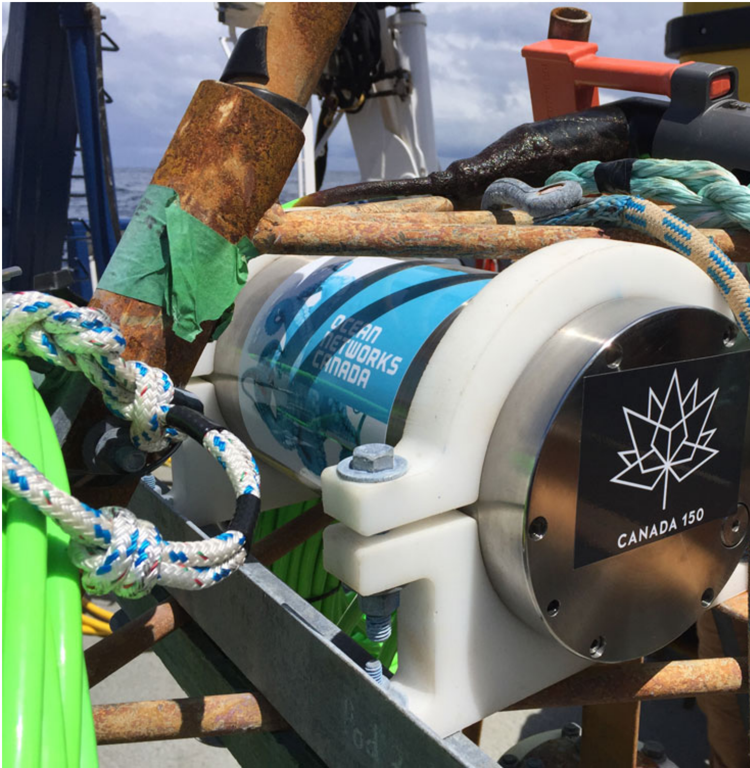
Figure 2. A #Canada150 logo on a camera tripod soon to be deployed in over 1km of water at Barkley Canyon.

To validate that Canada's ocean is part of the celebration, we emblazoned maple leaf stickers onto one of the remotely operated vehicles and many of the instruments ( Figure 2 ). Now we're wondering if they're the deepest observances of #Canada150 in the country??