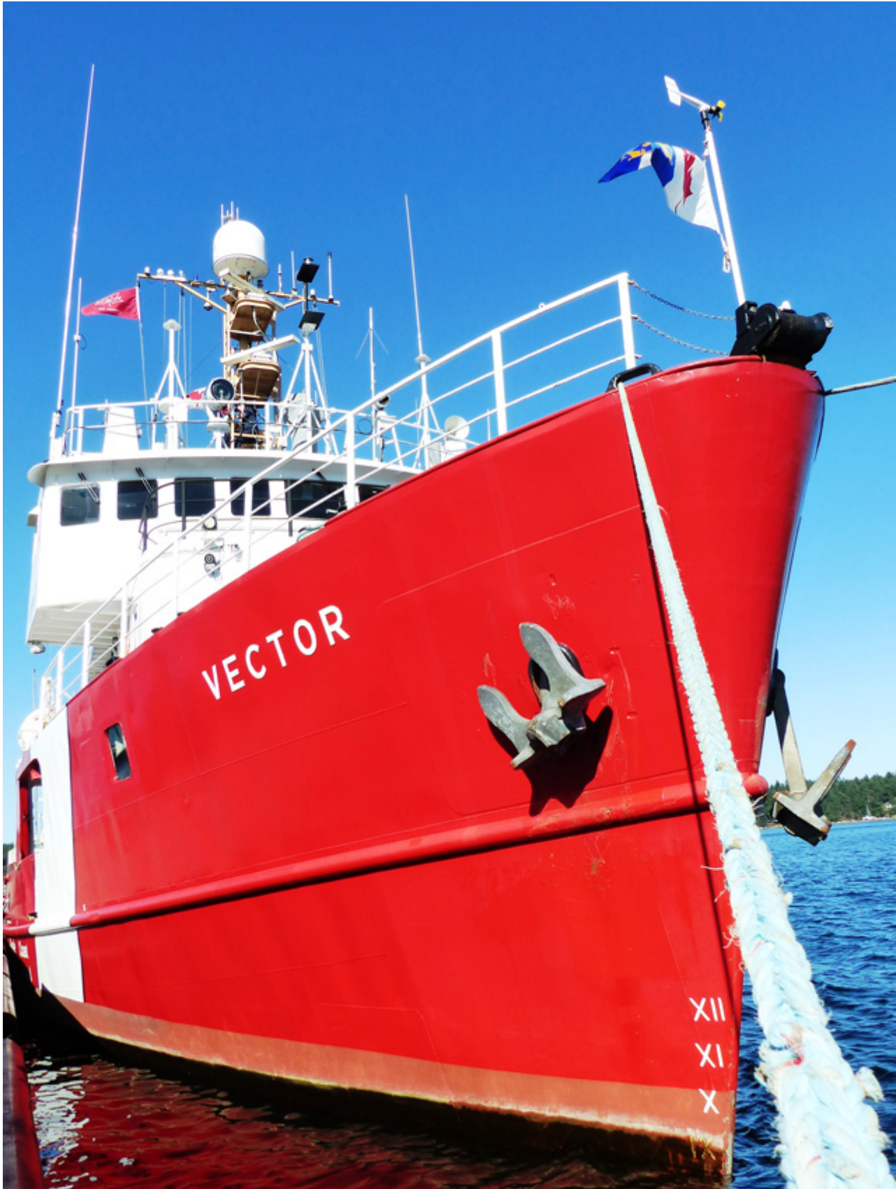
CCGS Vector.