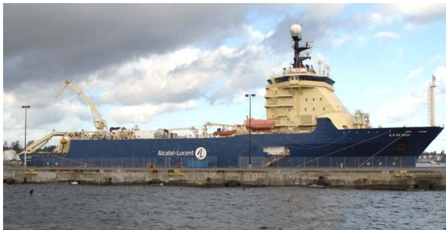
Ile de Sein at Ogdan Point—Installation of cable complete

Our major news since our last Newsletter in September is the completion of the first phase of the infrastructure installation. The 800km backbone cable, repeaters, branching units and spur cables to the node locations were deployed by Alcatel-Lucent using the Ile de Sein cable ship (140m; 10,000 tonnes). The installation began on 23 August and was completed on 7 November, taking a few weeks longer than anticipated due to several spells of bad weather that forced cessation of operations and some technical issues. Three ships were actually employed, with the addition of the M/V Frosti out of Vancouver for clearing decommissioned cabled along the shelf transects where the cable was to be buried to an average