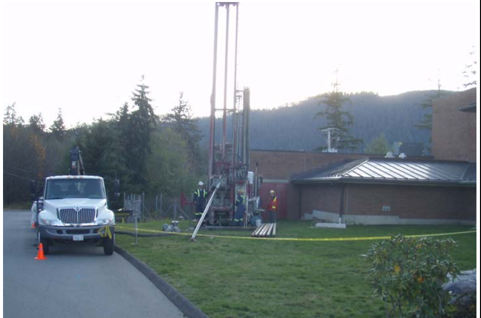
Drilling operations for borehole strain-meter

UNAVCO ( www.unavco.org ) profit, membership-governed consortium that supports and promotes Earth science by advancing high-precision techniques for the measurement and understanding of crustal deformation. The PBO studies the three-dimensional strain field resulting from active plate boundary deformation across the Western United States and Canada. It is part of the EarthScope Project ( www.earthscope.org ), a major NSF-funded project that will ultimately see about 900 new continuous Global Positioning Systems (GPS) stations and about 100 borehole strain-meters (BSMs) in the western US and extending into Canada. The strain-meter in this location will serve as an excellent 'landward extension' of offshore monitoring of seismicity or pressure in ODP/IODP holes connected into the NEPTUNE Canada array.