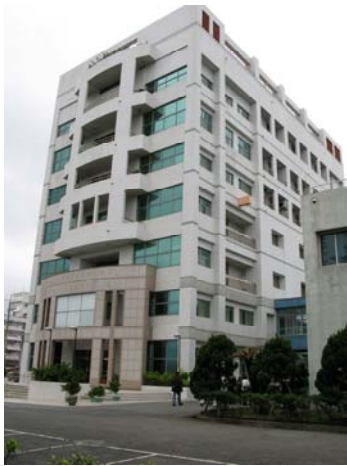
Shore Station north of Taipei, Taiwan