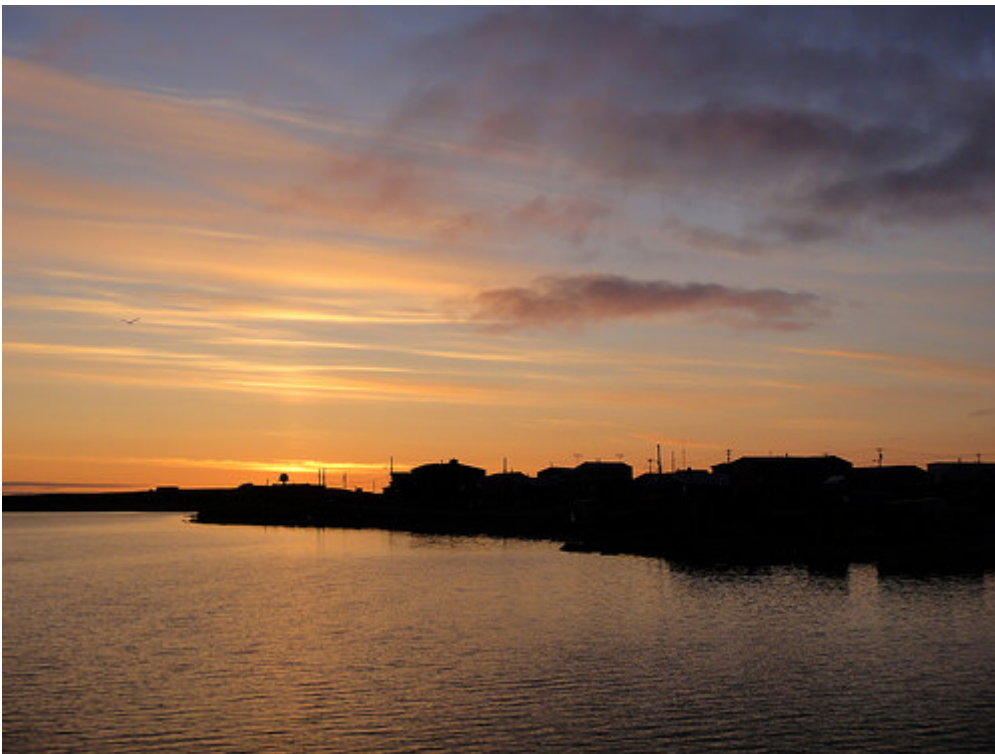
Twilight at Cambridge Bay, Nunavut.

Unseen beneath the surface of the Arctic Ocean, the Ocean Networks Canada ocean observatory in Cambridge Bay, Nunavut, monitors ocean conditions 24/7. During the night of 13 October, sensors detected the seasonal return of surface sea ice.