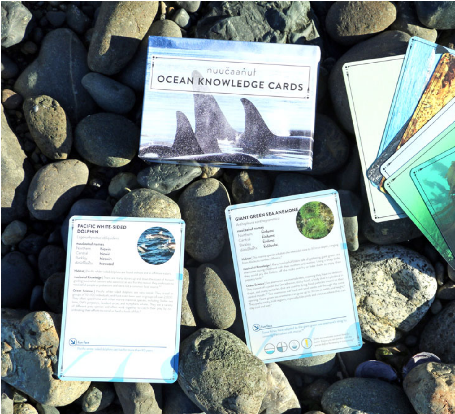
Figure 1. ONC collaborated with the Nuu-chah-nulth Tribal Council to create a deck of 36 Ocean Knowledge Cards. Highlighting sea life found along Vancouver Island's west coast, the cards show how the Nuu-chah-nulth people harvest and prepare these sea foods and their cultural significance.

To kick off Canada's sesquicentennial on the west coast, ONC channeled #Canada150 celebrations into the deep sea during its most recent expedition aboard exploration vessel (E/V) Nautilus.