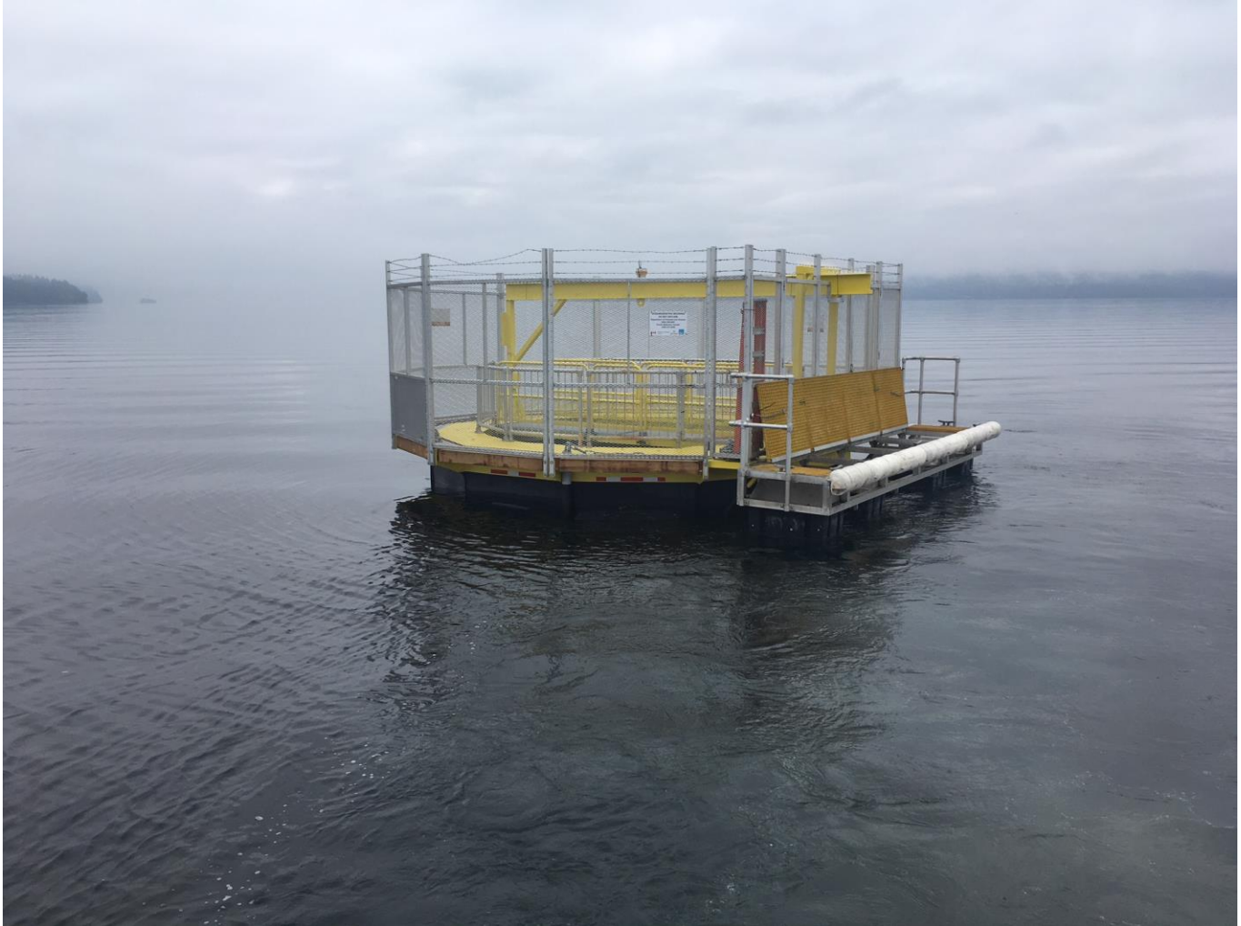
Figure 1: Surface Platform in Baynes Sound